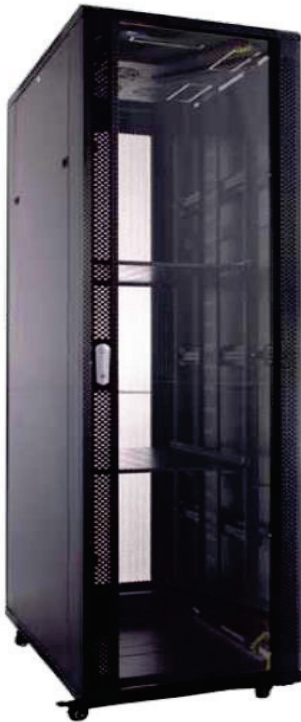
Reference image only